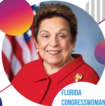
FLORIDA CONGRESSWOMAN DONNA SHALALA 2019 MASTER OF CEREMONIES

"It is an honor to serve as the Master of Ceremonies for AIDS Walk Miami on April 28 at Soundscape Park in Miami Beach. Advances in treatment and new prevention strategies have now made "Getting to Zero" - zero new infections, zero deaths, zero stigma - an achievable goal! Getting to zero still requires the efforts of everybody. Participation is critical to increasing awareness, fighting stigma, and raising funds to support the most vulnerable people living with HIV/AIDS in South Florida."